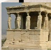
Ancient Greece 1200—900 BC