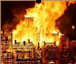
Great Fire of London 1666