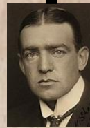
Ernest Shackleton 1874-1922