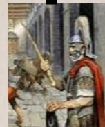
The Romans in Britain 43AD