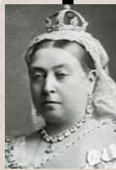
Queen Victoria 1819—1901