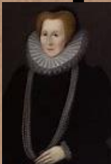
Bess of Hardwick 1527— 1608