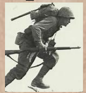
World War Two 1939—1945