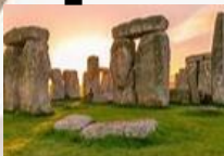
Stone Age to Iron Age 2000 BC