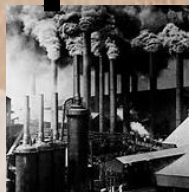
The Industrial Revolution 1850