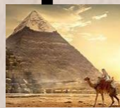
Ancient Egypt 400 BC