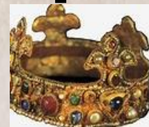
Anglo Saxons 450—1066