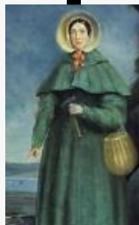
Mary Anning 1799— 1847