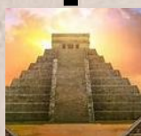
The Mayans 600 BC