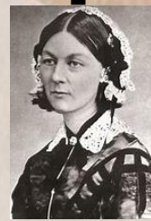
Florence Nightingale 1820—1910